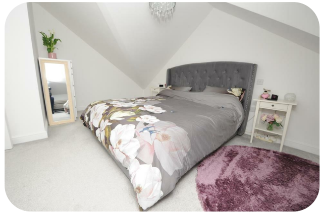
Bedroom Five / Study 13' x 6'9" (3.96m x 2.06m) With radiator.